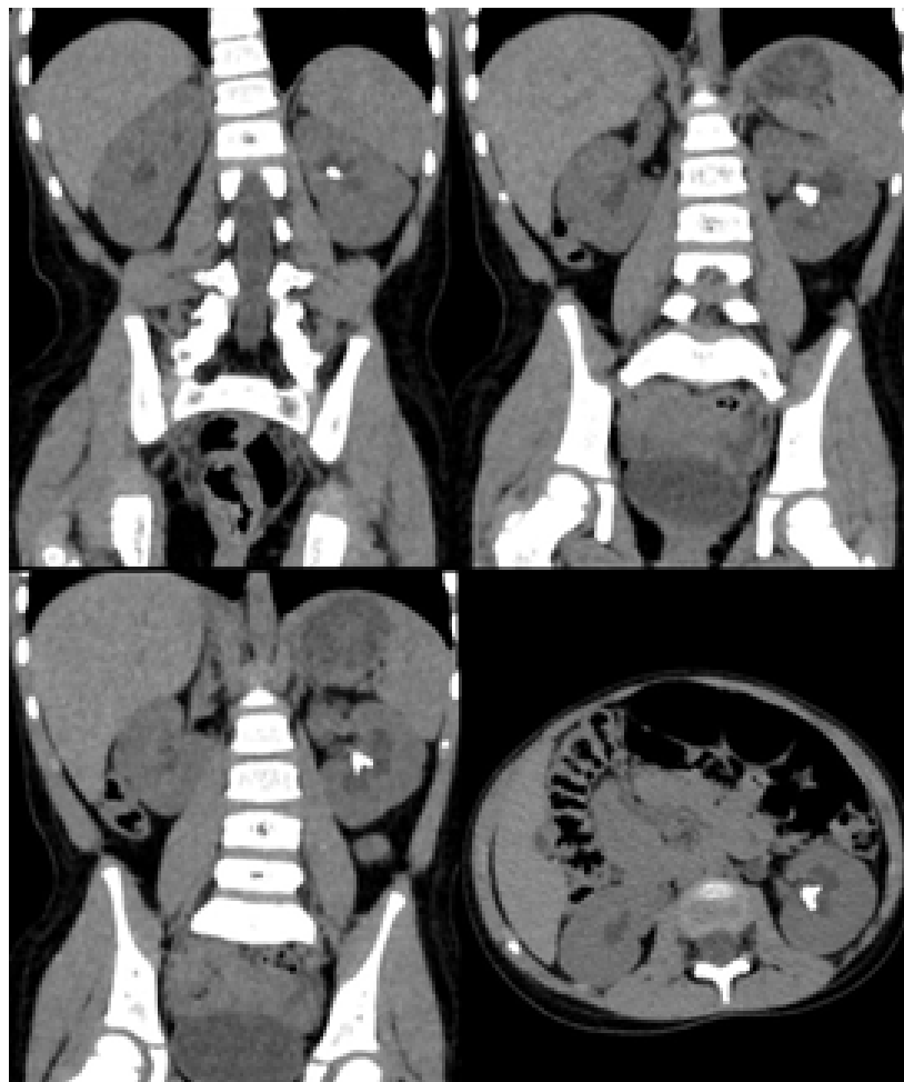
Figure 1: Stones filling two calyces in the left lower pole, one in the middle pole filling one calyx and extending towards the pelvis, and several in the upper pole calyces.

two ureter orifices were observed on the right and one on the left. A hybrid guide wire was introduced from the left ureteral orifice and advanced until the upper calyx. Another guidewire used as a safety guidewire and a 9.5 Fr 28 cm UAS were also placed in the proximal ureter over the first guidewire under fluoroscopy. The retrograde pyelogram revealed high-insertion ureteropelvic junction (UPJ), narrow infundibulopelvic angle, megacalycosis, and a small renal pelvis (Figure 3). Access of the flexible ureteroscope (Flex-X2, STORZ, Tuttlingen, Germany) to the stone was difficult due to the small pelvis and high insertion of the UPJ. The pelvic stone could be partially fragmented by holmium: YAG laser, whereas calyceal stones in the lower and middle poles were fragmented with either 272-micron (0.6 J and 10 Hz) or 200-micron (0.6 J and 8 Hz) laser probes (Sphinx, LISA, Katlenburg-Lindau, Germany). All the stones were fragmented until they were considered small enough to pass spontaneously.