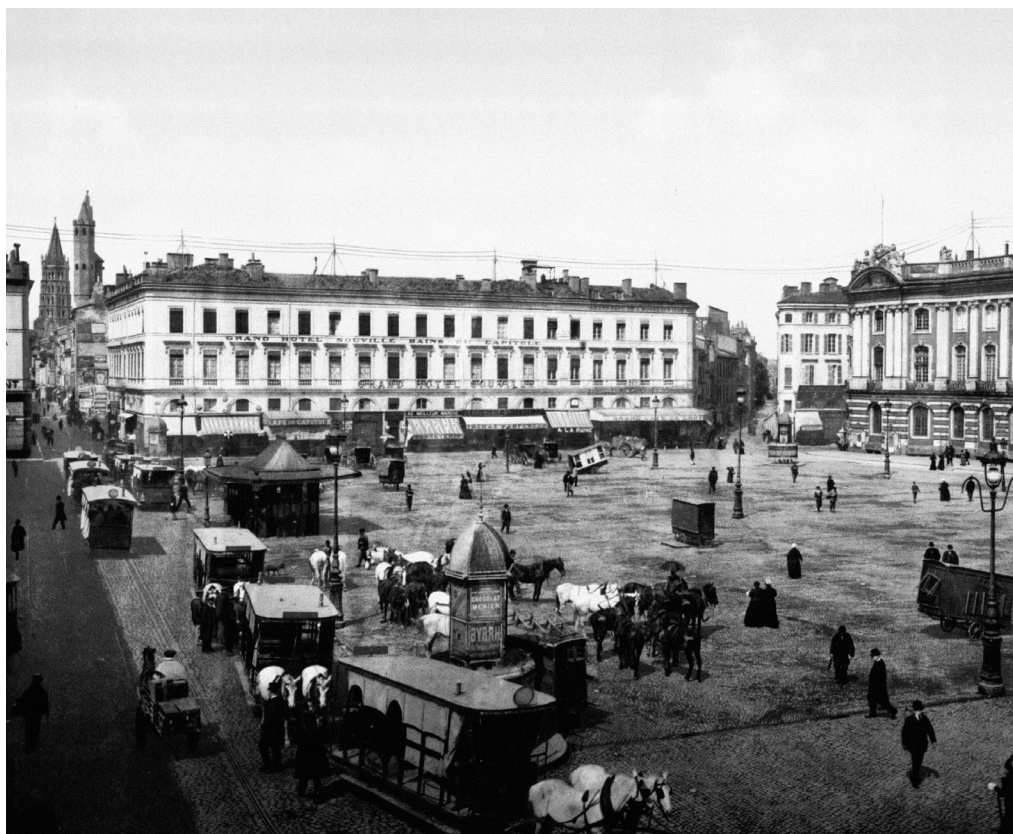
Capitol Place Toulouse, France