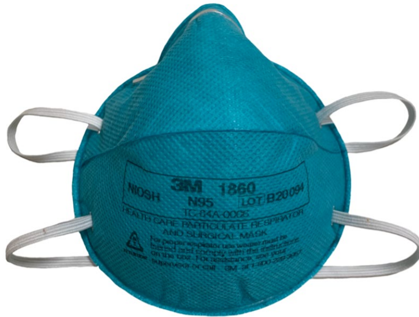
Figure 1: 3M™ (Saint Paul, Minnesota, USA) Health Care Particulate Respirator and Surgical Mask 1860, N95 120 EA/Case.

and related factors of COVID-19 infection in healthcare workers, it was found that 45 (29.80%) infected healthcare workers were male and 106 (70.20%) were female. 19 In European Union (EU) countries, a higher proportion of healthcare workers diagnosed with COVID-19 infection were female. 20